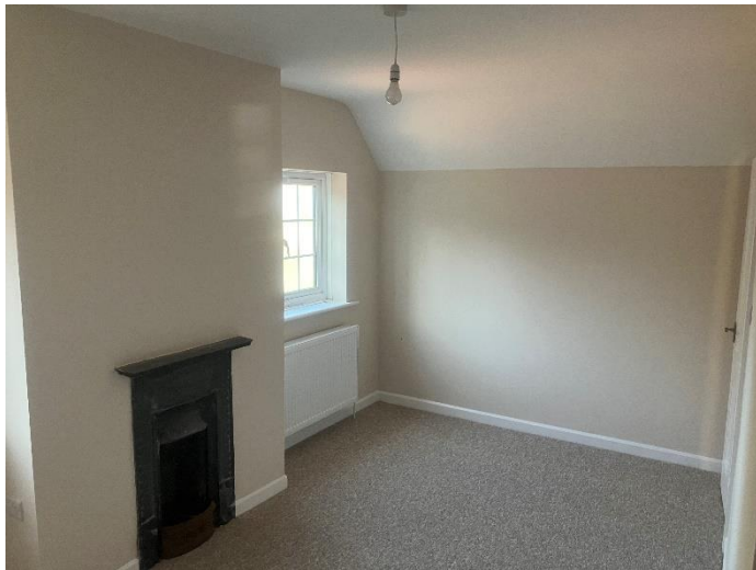
Double Bedroom One