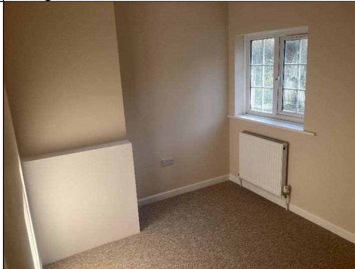
Double Bedroom Two