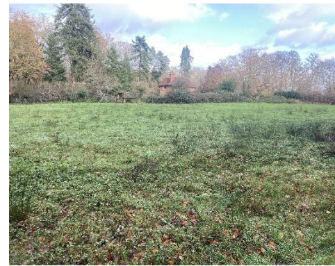
Grazing paddock towards property