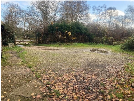
Yard and parking